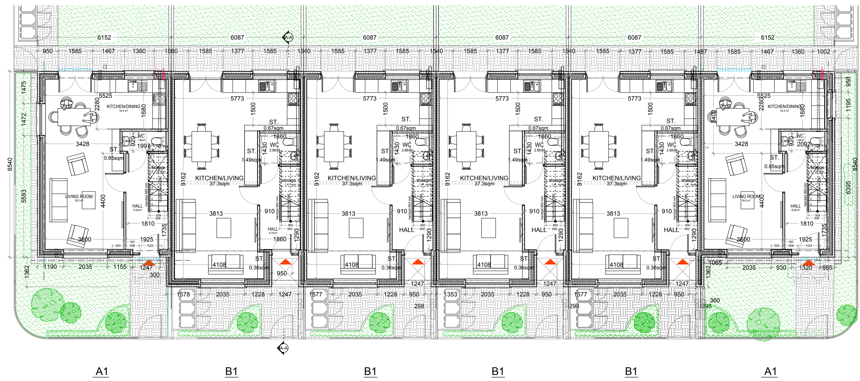
Block 6&11 (4no. house type B1 & 2no. house type A1) Ground Floor Plan Scale 1/100